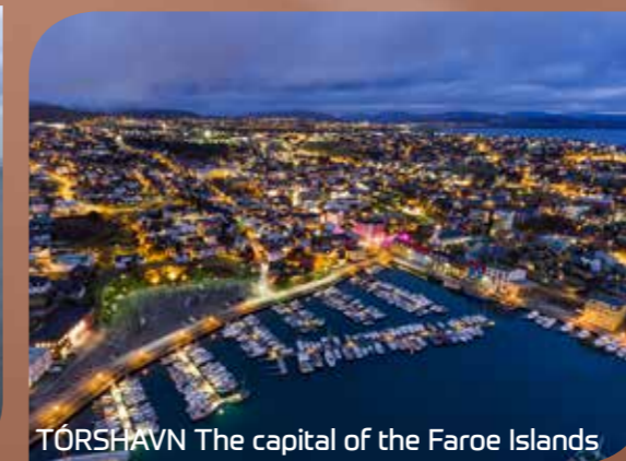
TÓRSHAVN The capital of the Faroe Islands