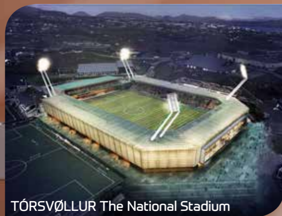
TÓRSVØLLUR The National Stadium