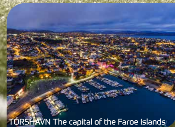
TÓRSHAVN The capital of the Faroe Islands