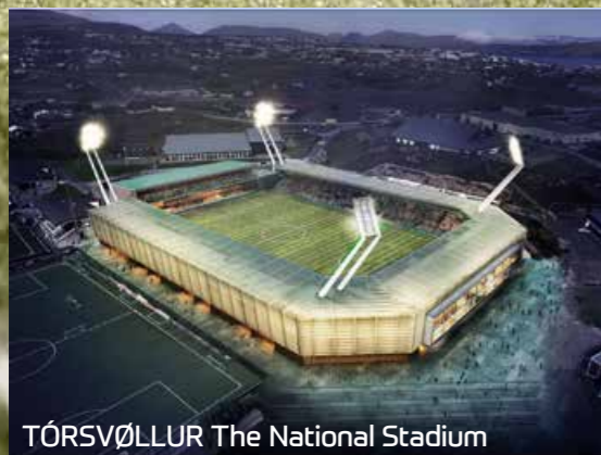
TÓRSVØLLUR The National Stadium